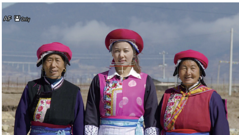
Face Detection AF

This feature is important especially in more demanding 4K shooting applications, such as recording interviews or lectures, helping a specific person subjects automatically stay in pin-sharp focus.