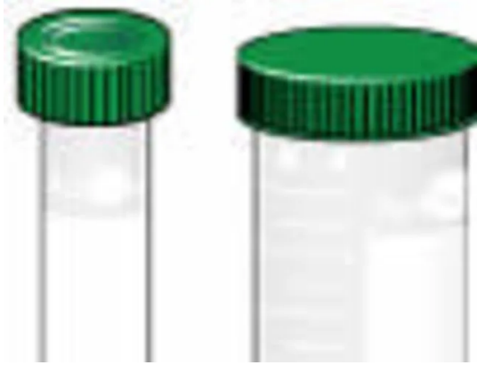
15 mL and 50 mL conical tubes.