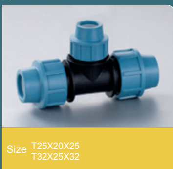
Ref. No. 2416 异径三通 Reduced Tee

Size T20 T25 T32 T40 T50 T63 T75 T90 T110