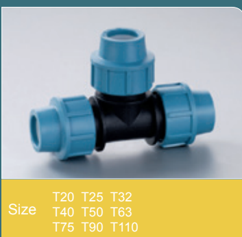
Ref. No. 2415 三通 Tee

Size T20 T25 T32 T40 T50 T63 T75 T90 T110