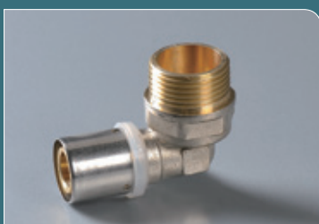
Ref. No. 2312 外丝弯头 Male Elbow

Size L16X1/2M L16X3/4M L18X1/2M L18X3/4M L20X1/2M L20X3/4M L25X1/2M L25X3/4M L25X1M L26X3/4M L26X1M L32X1M