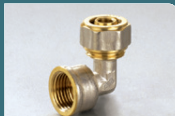
Ref. No. 2211 内丝弯头 Female Elbow

Size L16X1/2F L16X3/4F L18X1/2F L20X1/2F L20X3/4F L25X3/4F L25X1F L26X3/4F L26X1F L32X3/4F L32X1F