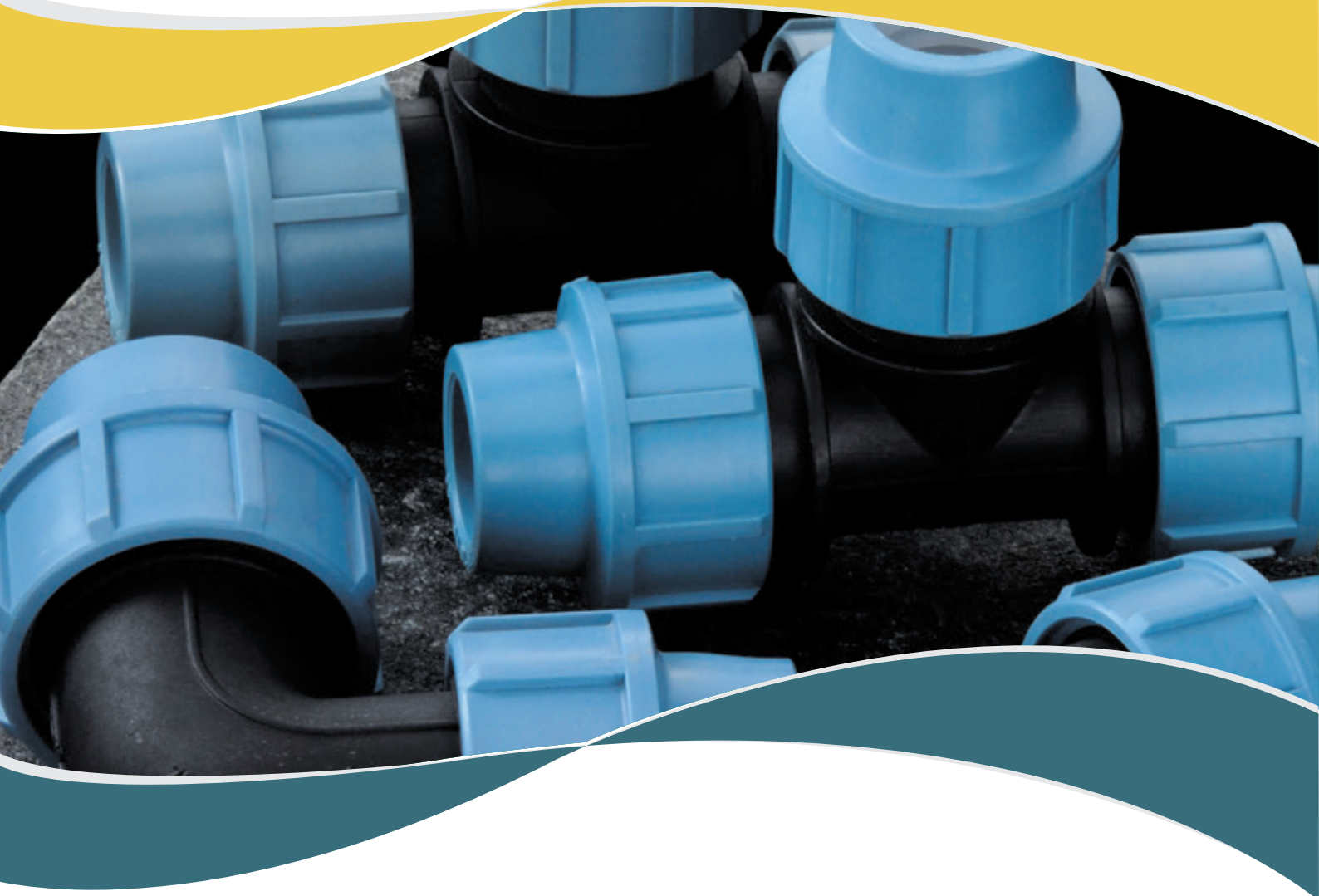
Ref. No. 2401 直接 Socket