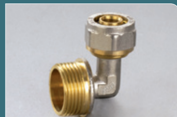
Ref. No. 2212 外丝弯头 Male Elbow

Size L16X1/2M L16X3/4M L18X1/2M L20X1/2M L20X3/4M L25X3/4M L25X1M L26X3/4M L26X1M L32X3/4M L32X1M