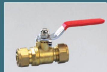
Ref. No. 2245 铝塑管球阀 Pex Valve