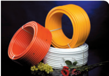
Ref. No. 1042 搭焊热水管 Overlap PEX/AL/PE Pipe