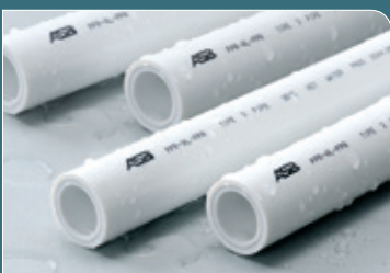
Ref. No. 1061 RPAP5管材 RPAP5 Pipe