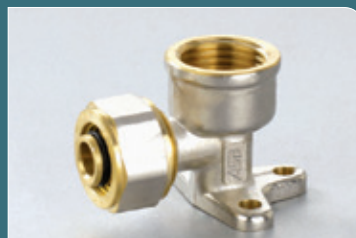
Ref. No. 2213 内丝带座弯头 Seated Female Elbow

Size ZL16X1/2F ZL20X1/2F ZL16X3/4F ZL20X3/4F