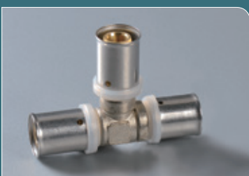
Ref. No. 2315 三通 Tee

Size ZL16X1/2F ZL16X3/4F ZL18X1/2F ZL18X3/4F ZL20X1/2F ZL20X3/4F