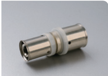
Ref. No. 2302 异径直接 Reduced Socket

Size S16X20 S16X25 S18X32 S25X20 S32X20 S32X25