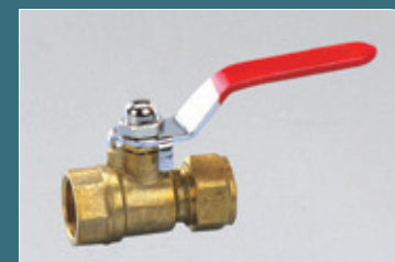
Ref. No. 2247 内丝球阀 Female Ball Valve

Size 16X1/2F 20X1/2F 25X3/4F 26X3/4F 32X1F