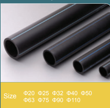
Ref. No. 1081 PE管材 PE Pipe

Size Φ20 Φ25 Φ32 Φ40 Φ50 Φ63 Φ75 Φ90 Φ110