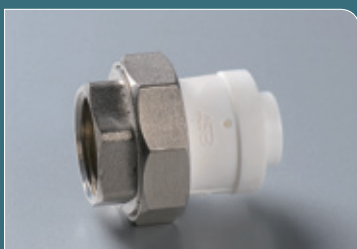
Ref. No. 2521 内丝活接 Female Union