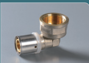
Ref. No. 2311 内丝弯头 Female Elbow

Size L16X1/2F L16X3/4F L18X1/2F L18X3/4F L20X1/2F L20X3/4F L25X1/2F L25X3/4F L25X1F L32X1F