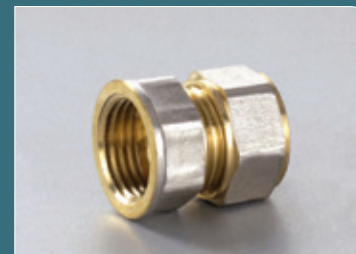
Ref. No. 2205 内丝直接 Female Socket

Size S16X1/2F S16X3/4F S18X1/2F S20X1/2F S20X3/4F S20X1F S25X1/2F S25X3/4F S25X1F S26X1/2F S26X3/4F S26X1F S32X3/4F S32X1F