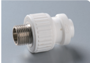
Ref. No. 2504 外丝直接 Male Socket

Size S20X1/2M S20X3/4M S25X1/2M S25X3/4M