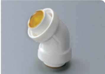
Ref. No. 2506 45度弯头 45° Elbow

Size S20X1/2M S20X3/4M S25X1/2M S25X3/4M