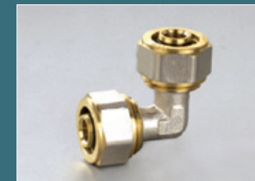
Ref. No. 2208 弯头 Elbow

Size S16X1/2F S16X3/4F S18X1/2F S20X1/2F S20X3/4F S20X1F S25X1/2F S25X3/4F S25X1F S26X1/2F S26X3/4F S26X1F S32X3/4F S32X1F