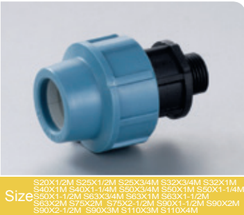
Ref. No. 2404 外丝直接 Male Socket

Size S20X1/2M S25X1/2M S32X3/4M S32X1M S40X1M S40X1-1/4M S50X3/4M S50X1M S50X1-1/4M S60X1-1/2M S63X3/4M S63X1M S63X1-1/2M S63X2M S75X2M S75X2-1/2M S90X1-1/2M S90X2M S90X2-1/2M S90X3M S110X3M S110X4M