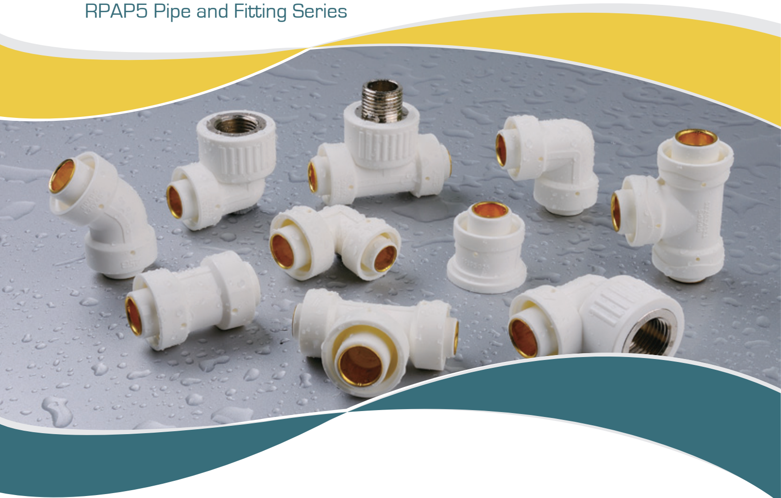
Ref. No. 2501 直接 Socket