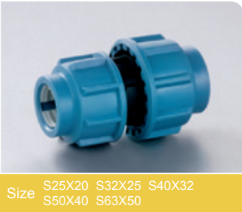
Ref. No. 2402 异径直接 Reduced Socket

Size S20 S25 S32 S40 S50 S63 S75 S90 S110