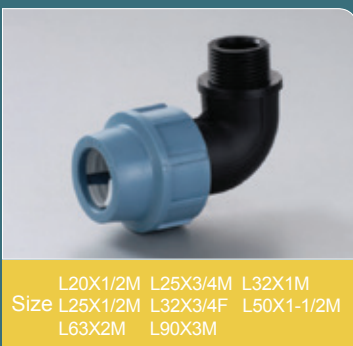
Ref. No. 2412 外丝弯头 Male Elbow

Size L20X1/2M L25X3/4M L32X1M L25X1/2M L32X3/4F L50X1-1/2M L63X2M L90X3M