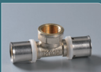
Ref. No. 2317 内丝三通 Female Tee

Size T16X1/2F T16X3/4F T18X1/2F T18X3/4F T20X1/2F T20X3/4F T25X3/4F T32X3/4F