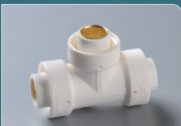
Ref. No. 2516 异径三通 Reduced Tee