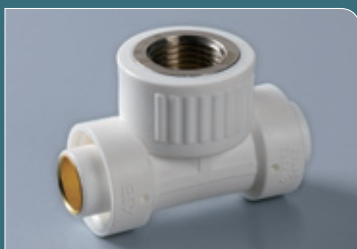
Ref. No. 2517 内丝三通 Female Tee