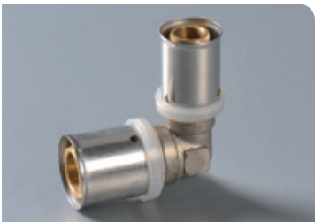
Ref. No. 2309 异径弯头 Reduced Elbow