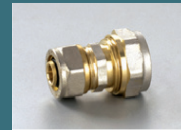
Ref. No. 2202 异径直接 Reduced Socket

Size S16X20 S16X25 S16X26 S20X25 S20X26 S20X32 S25X32 S26X32