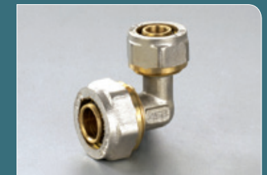
Ref. No. 2209 异径弯头 Reduced Elbow

Size L16X20 L16X25 L16X26 L16X32 L20X25 L20X26 L32X20 L32X25 L32X26