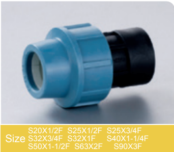
Ref. No. 2405 内丝直接 Female Socket

Size S20X1/2F S25X1/2F S25X3/4F S32X3/4F S32X1F S40X1-1/4F S50X1-1/2F S63X2F S90X3F