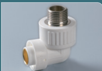
Ref. No. 2512 外丝弯头 Male Thread Elbow

Size S20X1/2M S20X3/4M S25X1/2M S25X3/4M