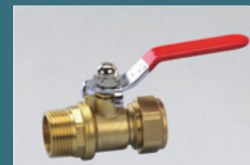
Ref. No. 2246 外丝球阀 Male Ball Valve

Size 16X1/2M 20X1/2M 25X3/4M 26X3/4M 32X1M