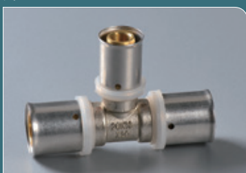
Ref. No. 2316 异径三通 Reduced Tee

Size T18X16X16 T18X18X16 T18X20X18 T16X20X16 T20X16X16 T20X18X20 T20X18X16 T20X20X16 T32X25X25 T20X25X20 T18X18X18 T25X25X20 T32X20X32 T32X25X32 T32X32X25 T25X16X25 T25X20X25