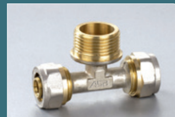
Ref. No. 2218 外丝三通 Male Tee

Size T16X1/2M T16X3/4M T18X1/2M T20X1/2M T20X3/4M T25X3/4M T25X1M T26X3/4M T26X1M T32X3/4M T32X1M