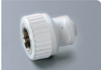
Ref. No. 2505 内丝直接 Female Socket

Size S20X1/2M S20X3/4M S25X1/2M S25X3/4M