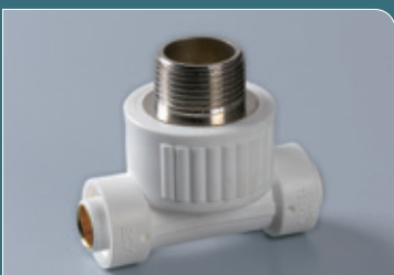
Ref. No. 2518 外丝三通 Male Tee

Size T20X1/2M T20X3/4M T25X1/2M T25X3/4M