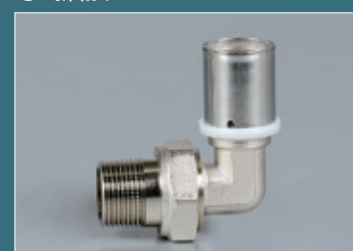
Ref. No. 2324 弯式活接 Male Union