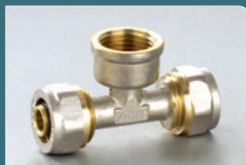
Ref. No. 2217 内丝三通 Female Tee

Size T16X1/2F T16X3/4F T18X1/2F T20X1/2F T20X3/4F T25X3/4F T25X1F T26X3/4F T26X1F T32X3/4F T32X1F