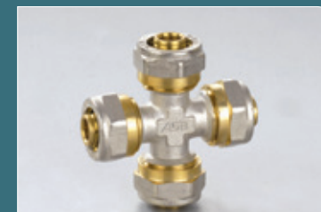
Ref. No. 2228 四通 Cross

Size T16X1/2M T16X3/4M T18X1/2M T20X1/2M T20X3/4M T25X3/4M T25X1M T26X3/4M T26X1M T32X3/4M T32X1M