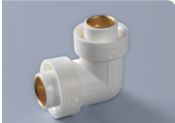
Ref. No. 2509 异径弯头 Reduced Elbow