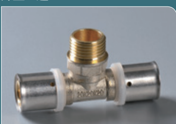
Ref. No. 2318 外丝三通 Male Tee

Size T16X1/2M T16X3/4M T18X1/2M T18X3/4M T20X1/2M T20X3/4M T25X3/4M