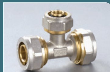
Ref. No. 2216 异径三通 Reduced Tee

Size T20X16X20 T25X16X25 T25X20X25 T26X16X26 T26X20X26 T32X20X32 T32X25X32 T32X26X32