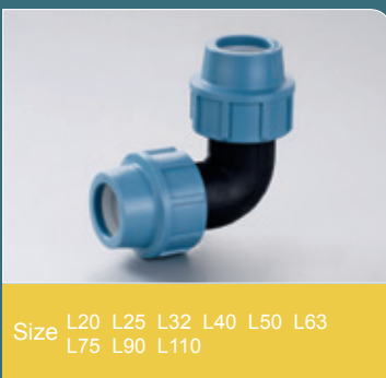
Ref. No. 2408 弯头 Elbow

Size L20 L25 L32 L40 L50 L63 L75 L90 L110