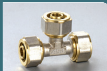
Ref. No. 2215 三通 Tee

Size ZL16X1/2F ZL20X1/2F ZL16X3/4F ZL20X3/4F