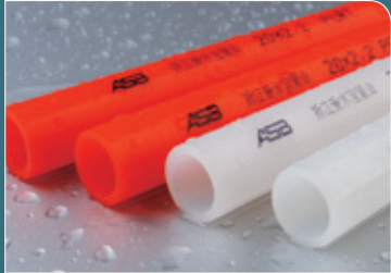
Ref. No. 1052 PEX-b地暖管 PEX-b Pipe

Size 16x2.0 16x2.2 20x2.0 20x2.2 25x2.2 25x2.5 32x2.5 32x3.0