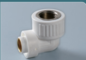
Ref. No. 2511 内丝弯头 Female Elbow

Size S20X1/2F S20X3/4F S25X1/2F S25X3/4F