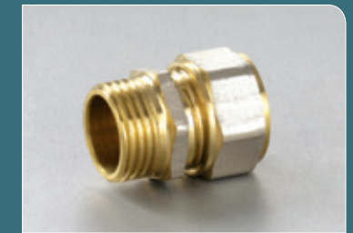
Ref. No. 2204 外丝直接 Male Socket

Size S16X1/2M S16X3/4M S18X1/2M S20X1/2M S20X3/4M S20X1M S25X1/2M S25X3/4M S25X1M S26X1/2M S26X3/4M S26X1M S32X3/4M S32X1M