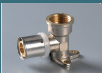
Ref. No. 2313 内丝带座弯头 Seated Female Elbow

Size ZL16X1/2F ZL16X3/4F ZL18X1/2F ZL18X3/4F ZL20X1/2F ZL20X3/4F