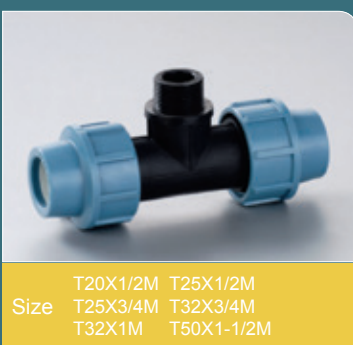
Ref. No. 2418 外丝三通 Male Tee

Size T20X1/2M T25X1/2M T25X3/4M T32X3/4M T32X1M T50X1-1/2M