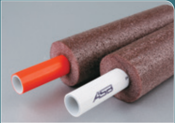
Ref. No. 1054 保温管 Insulated Pipe