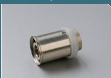
Ref. No. 2329 堵头 Stop

Size T16X1/2M T16X3/4M T18X1/2M T18X3/4M T20X1/2M T20X3/4M T25X3/4M