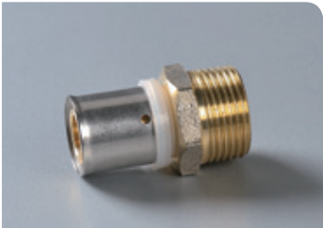
Ref. No. 2304 外丝直接 Male Socket

Size S16X1/2M S16X3/4M S18X1/2M S18X3/4M S20X1/2M S20X3/4M S20X1M S25X1/2M S25X3/4M S25X1M S32X3/4M S32X1M