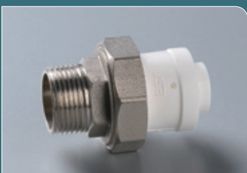
Ref. No. 2520 外丝活接 Male Union

Size T20X1/2M T20X3/4M T25X1/2M T25X3/4M