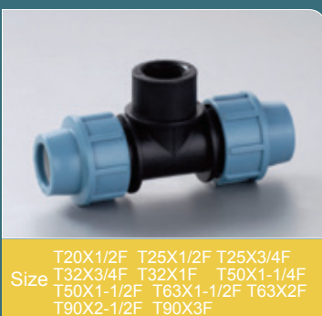
Ref. No. 2417 内丝三通 Female Tee

Size T20X1/2F T25X1/2F T25X3/4F T32X3/4F T32X1F T50X1-1/4F T50X1-1/2F T63X1-1/2F T63X2F T90X2-1/2F T90X3F