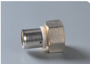
Ref. No. 2305 内丝直接 Female Socket

Size S16X1/2F S16X3/4F S18X1/2F S18X3/4F S20X3/4F S20X3/4F S25X1/2F S25X3/4F S25X1F S32X1F