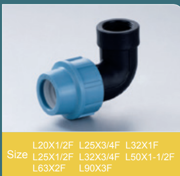
Ref. No. 2411 内丝弯头 Female Elbow

Size L20X1/2F L25X3/4F L32X1F L25X1/2F L32X3/4F L50X1-1/2F L63X2F L90X3F