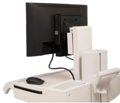
OPTIPLEX MICRO DUAL VESA MOUNT

This mount allows the Micro to be VESA mounted to select Dell E Series displays.