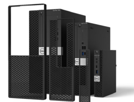
OPTIPLEX DUST FILTERS

Thermally tested custom cable covers offer an easy to install and attractive way to manage cables and secure ports.