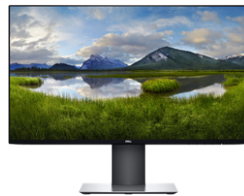
DELL ULTRASHARP 24 MONITOR - U2419H

23.8" ultrathin bezel optimized for dual display productivity. Easy Arrange feature enables multitasking efficiency and its small base frees valuable workspace.