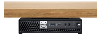
OPTIPLEX MICRO VESA MOUNT

Mount your system on a wall or under a surface with full optical drive access. Includes an adapter box to securely house the system's power adapter.